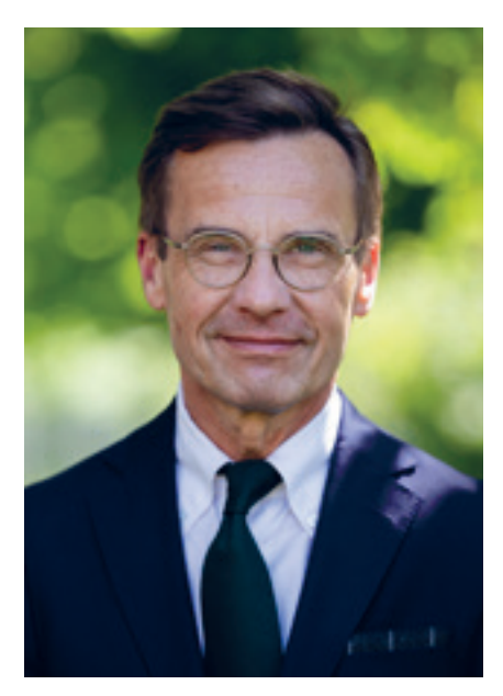
Ulf Kristersson, Prime Minister

When the Government took office almost two years ago, it was with a clear mandate to tackle Sweden's internal and external security. When our freedom and openness are threatened by hostile powers – within and beyond our national borders – no task is more important.