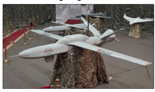
Figure 2. The Houthi Displayed "Sammad-3 long-range UAV"

Overall, after five years of military operations against the Yemeni government and Saudi-led coalition, it would appear that the Houthis are better equipped with sophisticated weaponry than in previous conflicts against its rivals. According to one observer, "We have witnessed a massive increase in capability on the side of the Houthis in recent years, particularly relating to ballistic missiles and drone technology.... The current capability is far more advanced than anything the Yemeni armed forces had before the civil war." In July 2019, the Houthis publicly