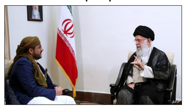
Figure 5. Iran's Supreme Leader meets with Houthi Spokesperson