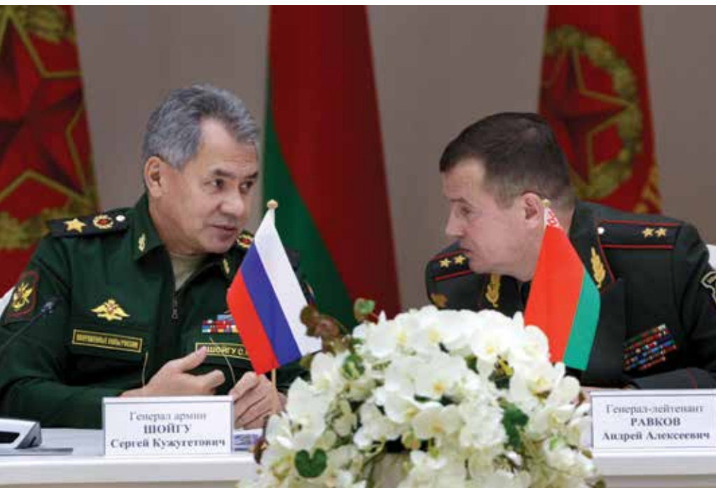
Russian and Belarusian Defence Ministers Sergei Shoigu and Andrei Ravkov

Russia attributes Belarus to its zone of influence and uses its territory for military operation planning and demonstration of force. Bela-