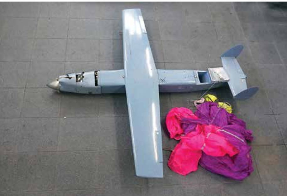
Russia-related UAV found in the territory of Lithuania

In 2016, a Russia-related reconnaissance UAV was found in the territory