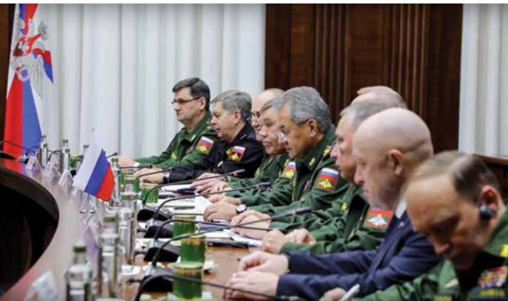
Russian oligarch Prigozhin (in plain clothes) also known as 'Putin's chef' participates in a meeting with a military delegation from Libya on 9 November 2018

The Kremlin tries to develop relations with academia and specifically targets those who feel unheard, initiates discussions where Moscow gets a venue to present the Russian vision of the world and the Russian ways to tackle problems. In 2018, the international community had many chances to witness the extent of Russia's attempts to meddle in domestic politics of other countries. Investigations on Russian