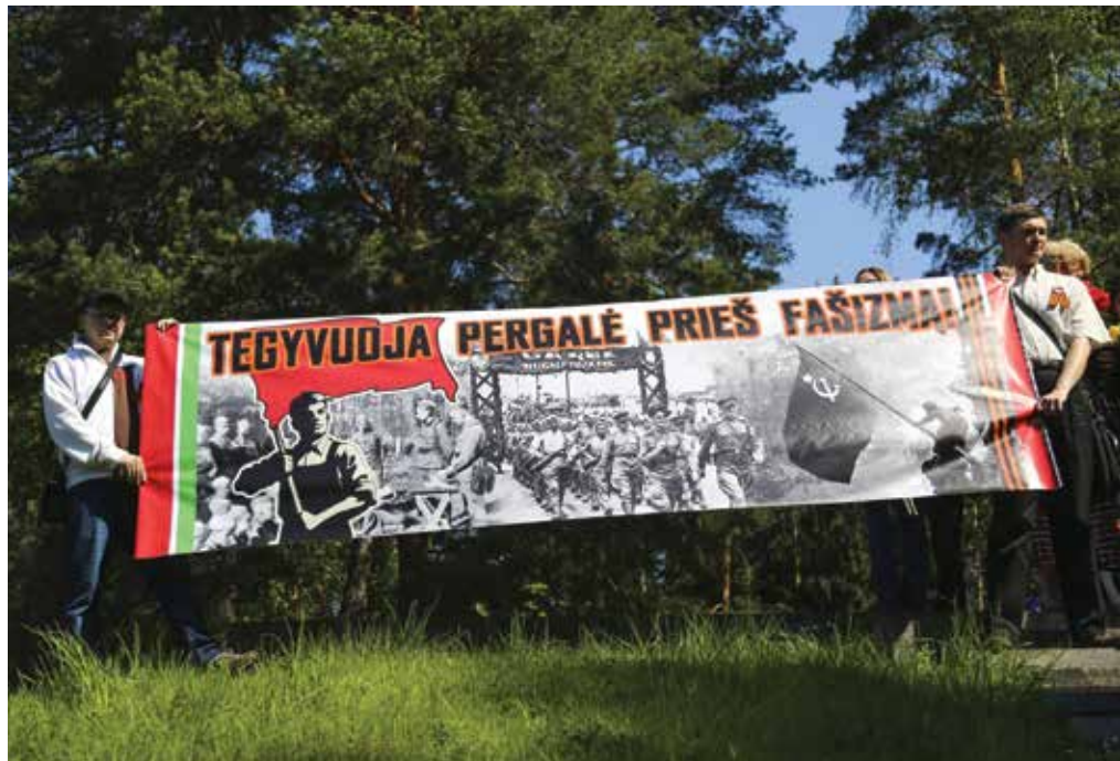
Commemoration of the 9th May in Lithuania

The Kremlin accuses those opposing its narrative of history falsification and alleged support for neo-Nazism or fascism. The Kremlin often selectively employs these accusations to justify both the Soviet role