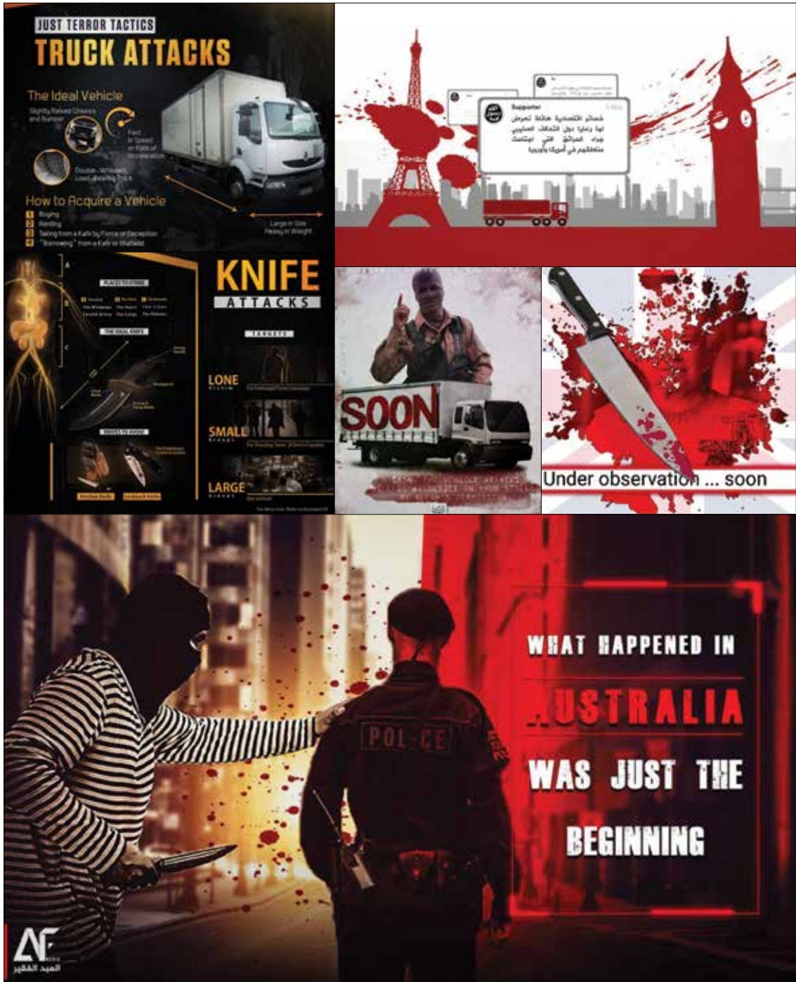
Online terrorism propaganda and instructions for staging attacks