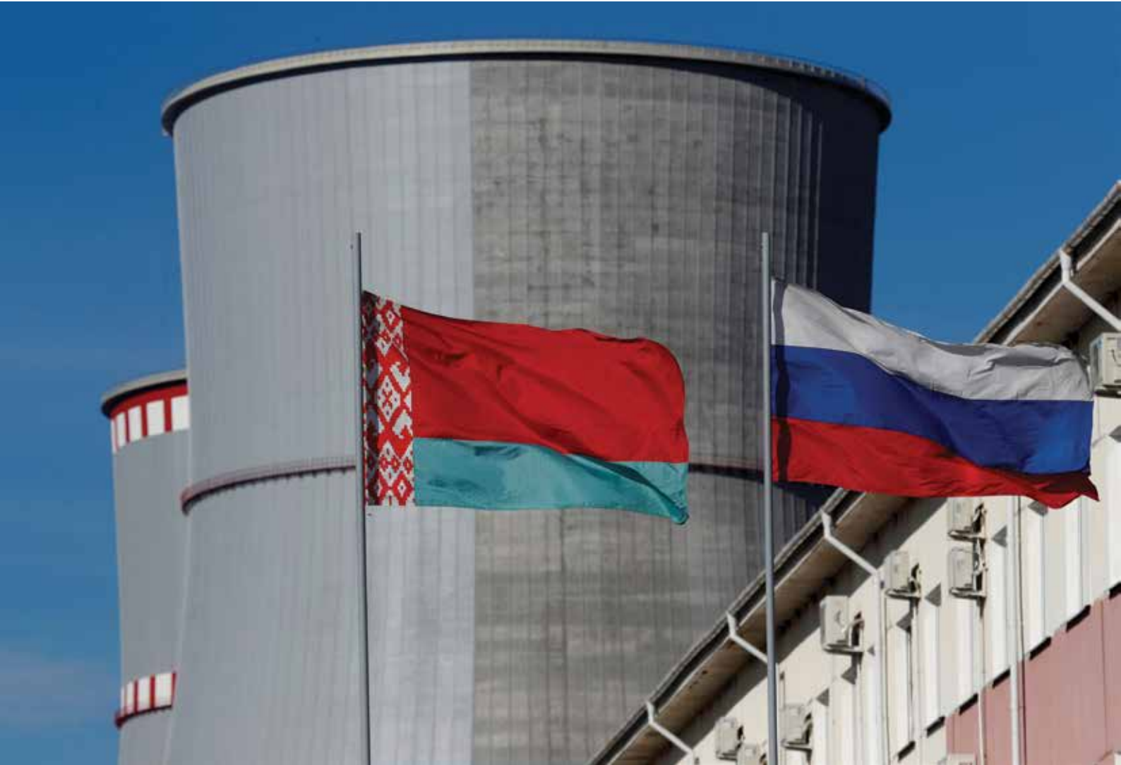
Belarus NPP – the nuclear energy project of Russia and Belarus