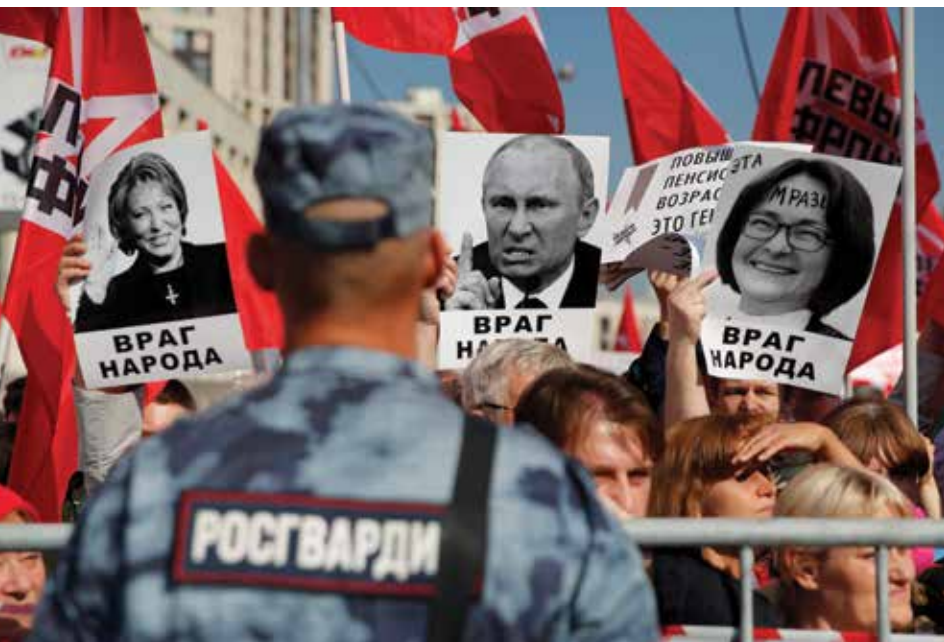
Protests against pension reform in Moscow

After the presidential elections, Russia's ruling regime embarked on long-delayed structural reforms. However, the very first step – pension reform – caused public resistance. Protest potential also surfaced during regional elections in September 2018. The ruling party United Russia and the Kremlin-supported candidates delivered the worst results in the last 10 years.