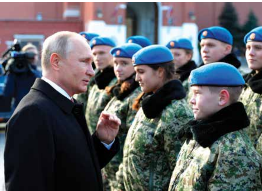
Putin meets members of the 'Young Army'

Russia would intend to revise its policies and posture towards de-escalation and reduction of tension in the region.