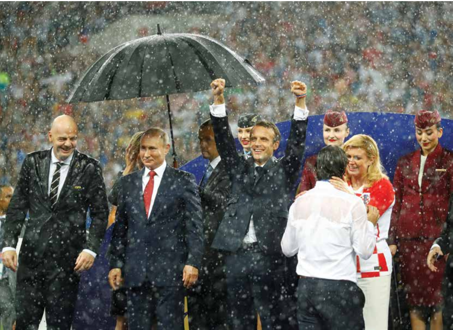
World Cup 2018 in Russia allowed Putin to step into the spotlight