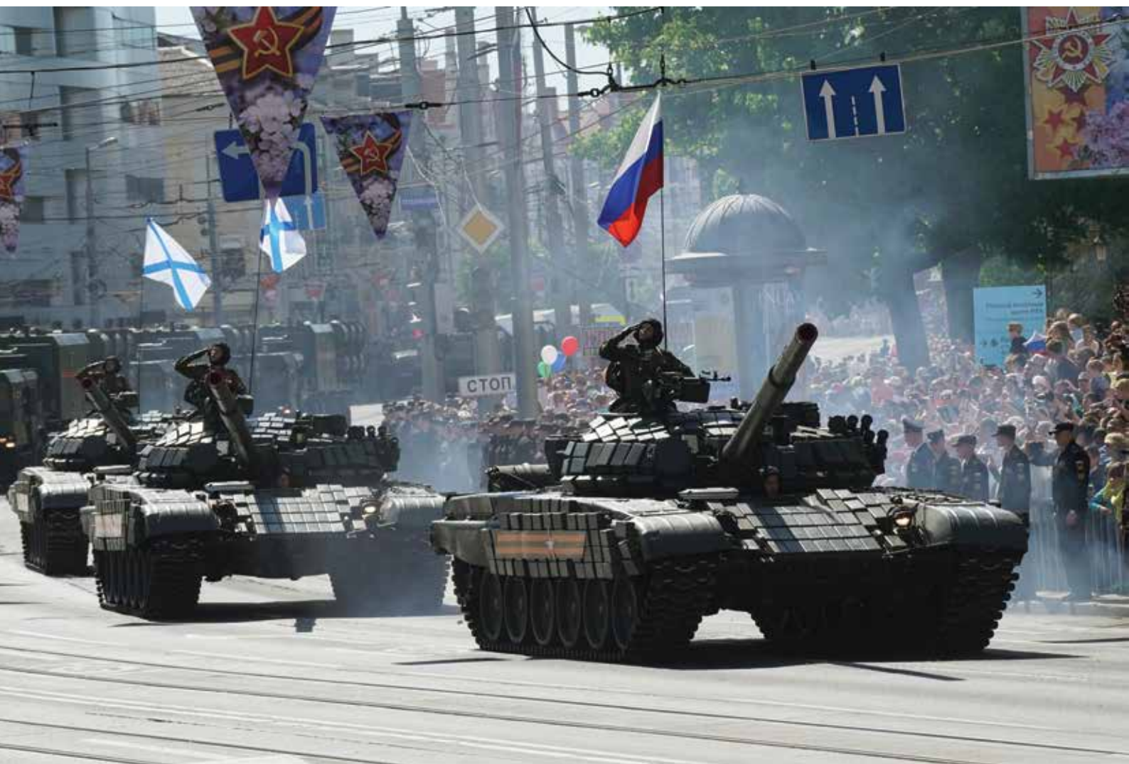
Military parade in Kaliningrad