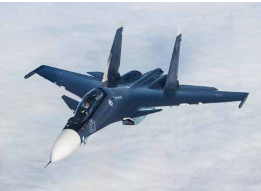
Su-30SM / Flanker-H

The processes in Kaliningrad Oblast are particularly important to Lithuania's military security. Russia consistently strengthens the military grouping based in Kaliningrad Oblast: it upgrades the old and develops new military infrastructure, establishes new military units, deploys new equipment, conducts intensive combat training in Kaliningrad's ground and naval ranges.