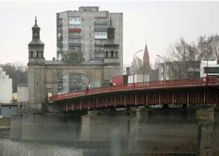
Russian intelligence services search targets among Lithuanian citizens crossing the border. The Queen Louise Bridge connects Lithuania with Kaliningrad Oblast.

Russian and Belarussian intelligence services have well developed intelligence from the territory against foreign citizens. Consistent trends show that Russian and Belarussian intelligence have particular interest in all Lithuanian citizens with intelligence access (especially, politicians, law enforcement and military officers, businesspersons, journalists) who have relatives in Russia or Belarus or travel there for other purposes. Such individuals may become targets for recruitment depending on their intelligence access, vulnerabilities, benevolence and dependency on Russia or Belarus.