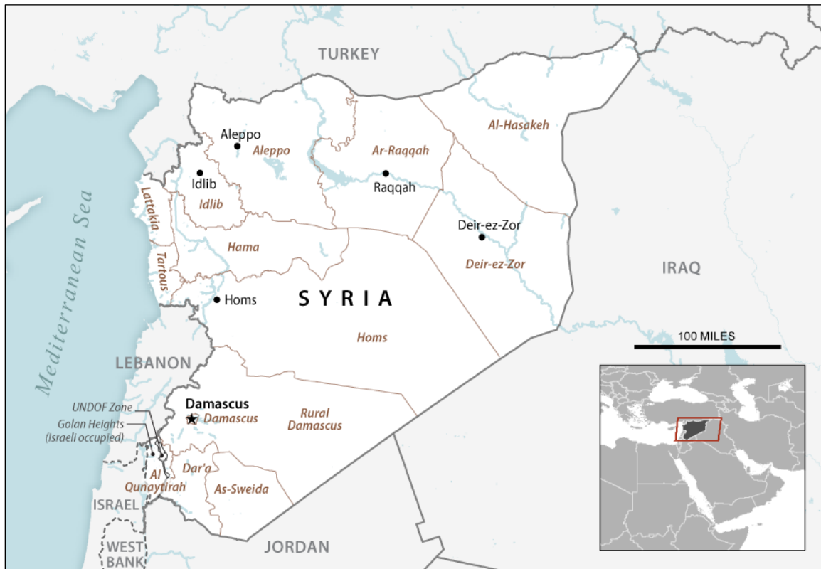
Figure I. Syria: Map and Country Data

The U.N. has sponsored peace talks in Geneva, but it is unclear when (or whether) the parties might reach a political settlement that could result in a transition away from Assad. With many armed opposition groups weakened, defeated, or geographically isolated, military pressure on the Syrian government to make concessions to the opposition has been reduced. U.S. officials have stated that the United States is committed to the enduring defeat of the Islamic State and will not fund reconstruction in Assad-held areas unless a political solution is reached in accordance with U.N. Security Council Resolution 2254. 3 Congress is considering legislation that would condition the use of U.S. funds in Assad-controlled areas for nonhumanitarian purposes and has directed the Administration to report to Congress on its strategy.