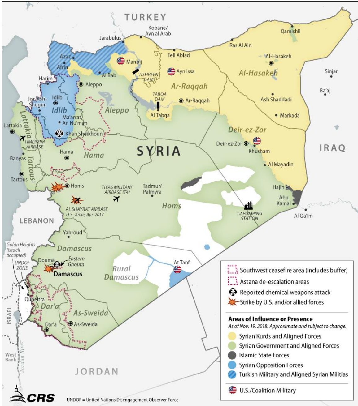
Figure 3. Syria Areas of Influence 2018 As of November 19, 2018

Source: CRS using area of influence data from IHS Conflict Monitor, last revised August 27, 2018. All areas of influence approximate and subject to change. Other sources include U.N. OCHA, Esri, and social media reports.