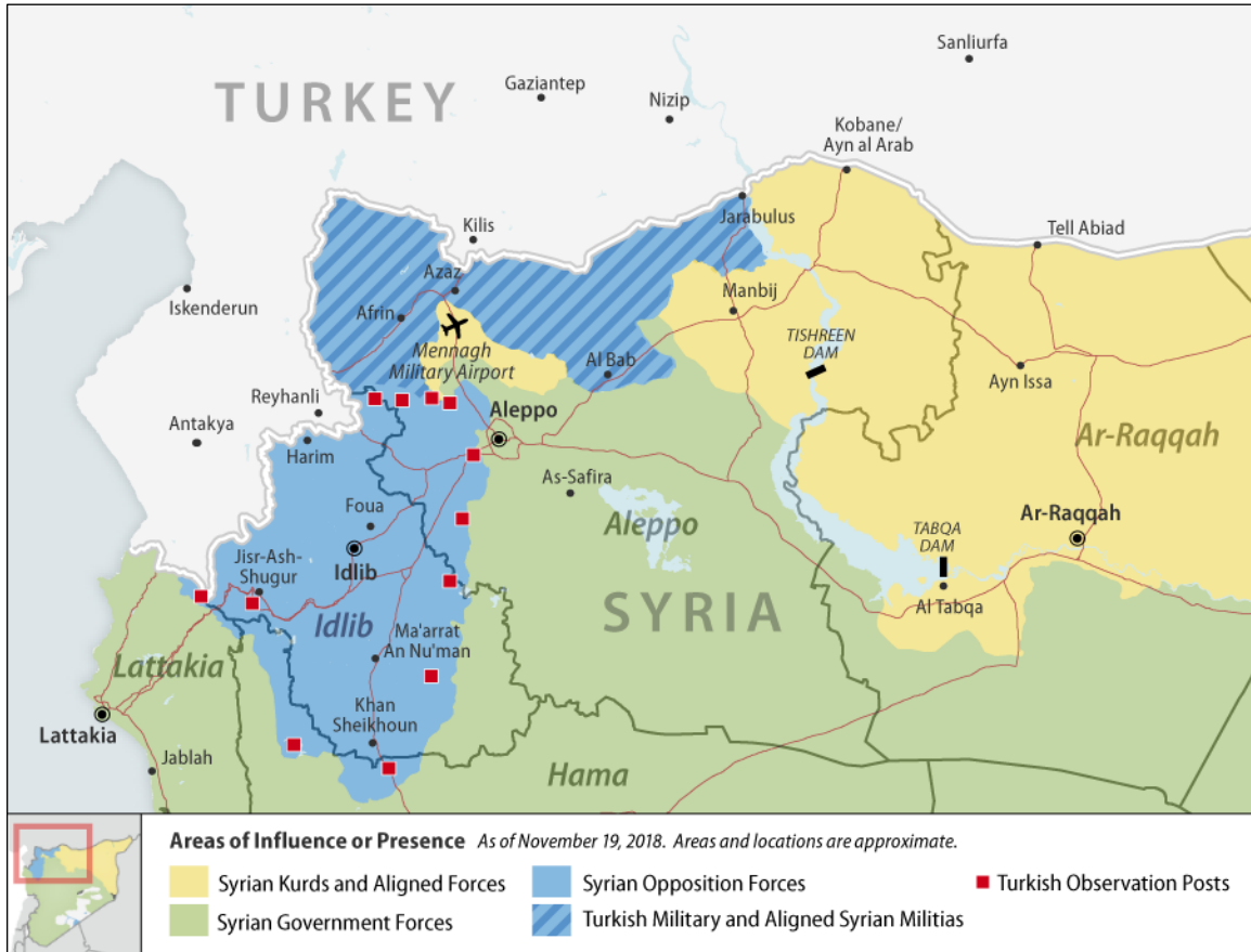
Figure 5. Northern Syria Areas of Control As of November 19, 2018